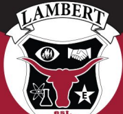
LAMBERT High School

Beginning Music Theory Jazz Band AP Art History